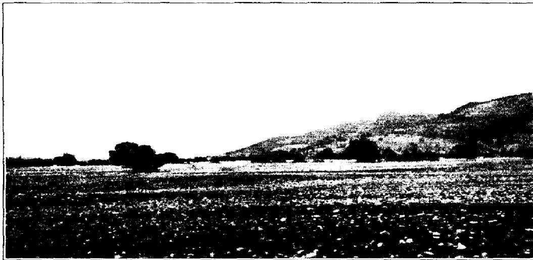
A. GRAVEL COVERED TERRACE IN THE ARTIBONITE VALLEY NEAR SAVANE-À ROCHE.